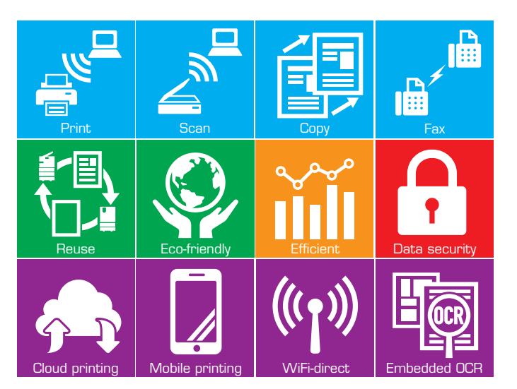
Toshiba's Hybrid MFP - all features you need in one unique system.

We strongly believe that good technology must be easy to use and that's how we designed the Hybrid MFP. The large tablet-like screen with an embedded web browser is easy to use and customisable to meet your needs. It gives direct access to all functions of the MFP and increases the efficiency of the users.